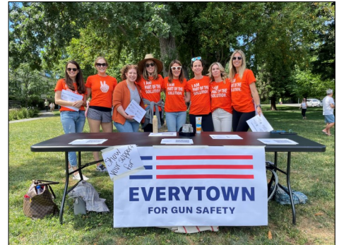
June 2, 2022 Event on Ross Common