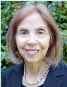
Elizabeth Robbins, M.D. Mayor

Mass shootings do not need to be an inevitable part of American life. In the ten years between 2009 and 2018, 1,121 people were killed in mass shootings in the U.S. and 836 more were wounded. The annual toll of all gun violence in the U.S. is staggering: nearly 120,000 people are shot each year, with over 40,000 dying. The Centers for Disease Control reports that firearms have now surpassed car accidents as the number one cause of death for children and adolescents. Despite repeated mass shootings and other firearm violence, no meaningful steps have been taken by Congress to address these tragedies.