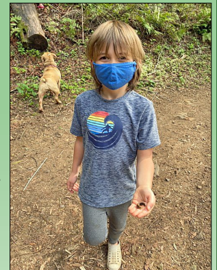
Holly Hoppin' Aftercare

Summer registration is OPEN!! Summer is going to be so fun this year. There will still be restrictions and guidelines but they will not take away from the joy of being outside, playing and laughing with friends. Many of our summer sessions have already filled so if you're interested in having your child attend, I would recommend signing up soon! We are offering our oldies but goodies; Top Gun, Sporty Girl, Holly Hoppin' at Phoenix Lake, LEGO Camp, Gone Fishin' Camp and then some new gems such as Lala & J Art Camp & Hip Hop Camp.