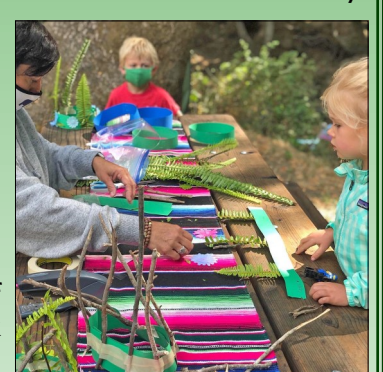
Making fern fairy crowns in Holly's afterschool program

filled but there are spots remaining in certain programs, please check it out! For session 2, we will be adding Soccer with Jean Marc for 1<sup>st</sup>-3<sup>rd</sup> graders and a fashion design class for 3<sup>rd</sup> -5<sup>th</sup> graders as well. Session 2 will begin the week of September 21<sup>st</sup> and we look forward to seeing you there!