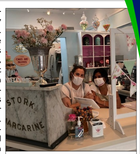
Crown & Crumpet

Downtown Ross is open for business! Crown & Crumpet officially opened their doors last week. Stop by for a bite or a beverage and to say hi to the team. Across the street, at 23 Ross Common, antiques dealer Upper Road West is putting the finishing touches on their Ross showroom. Additionally, the public health order has been amended to allow indoor hair salons to resume operations. MC23 Salon, Silhouette Hair Studio, and Atelier Emi have resumed business as usual (with all health and safety precautions in place, of course!)