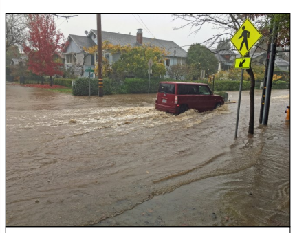
Bolinas Avenue December 15, 2016 Storm

The Town Council approved the design for the Bolinas Avenue Storm Drain Improvement Project and entered into an agreement with the Town of San Anselmo for sharing all costs for the design and construction of the