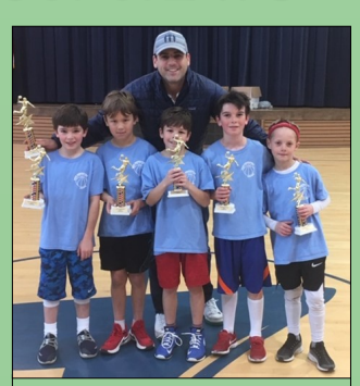
Boys 2<sup>nd</sup> grade champions, Raptors