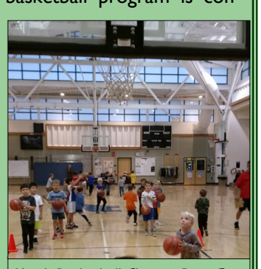
Youth Basketball Clinic at Ross Gym

The Ross Recreation youth basketball program is conducting clinics in December at Ross Gym. The clinics emphasize skill development in preparation for the winter basketball practices and games, which begin in January. The Ross Recreation program has 300 players from K through 4th grades and a total of 38 teams. Both boys and girls practice afterschool during the week-