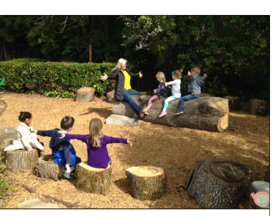
Current Ross Preschool Outdoor Classroom

Ross preschool has existed since the 1950's under various sponsors including Ross Recreation. The proposal seeks to continue the tradition of the preschool and add enhancements that will further improve this dynamic learning experience for preschool children.