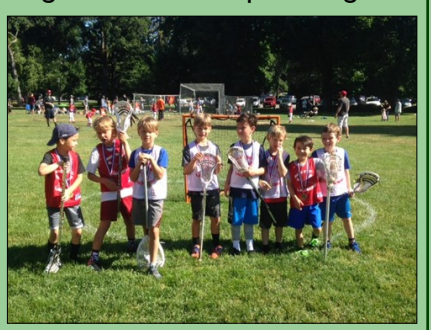
Players from the boys grade I - 2 league

development in a fun environment. Emphasis is on teamwork and sportsmanship.