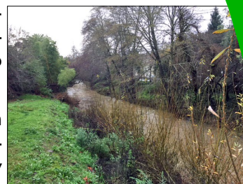
Corte Madera Creek January 9, 2018

With our first strong rainstorm of the season behind us, property owners are reminded once again what should be done now to prepare for the rainy season.