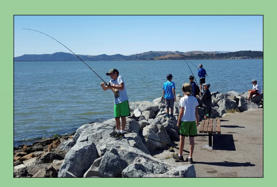
Fishing Camp at Loch Lomond Marina

This year the summer program was expanded to include new camps in mountain biking, cooking and fishing. The response to these new programs was very positive and Ross Recreation will continue to expand the late summer program options next year.