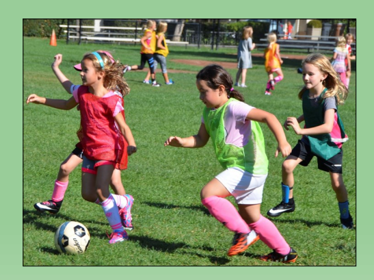
Youth Soccer at Ross Commons

Registration for the popular Ross Recreation youth soccer program is currently open. The program includes skill development and games and will run from September through mid-November.