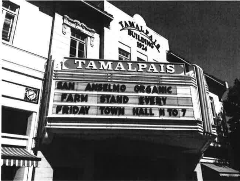
Figure 1 Tamalpais Marquis used to advertise the San Anselmo Organic Farm Stand