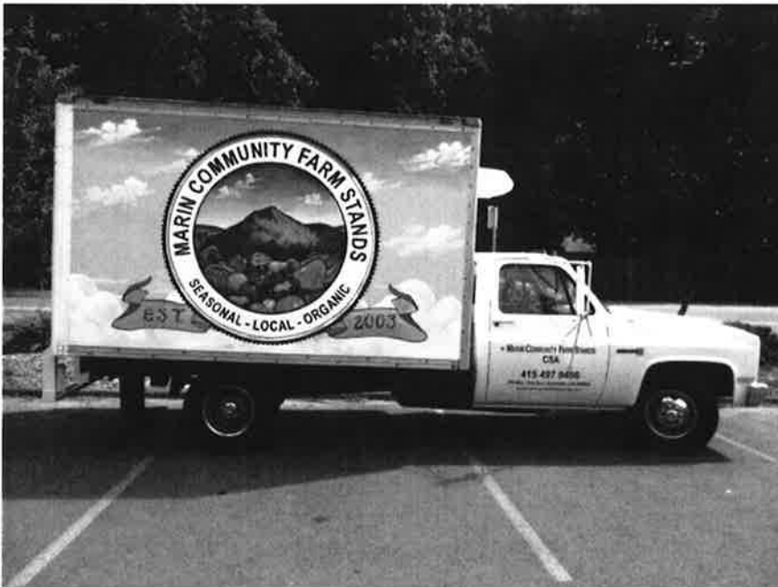
Figure 2 MCFS refrigerated truck is easily recognized everywhere