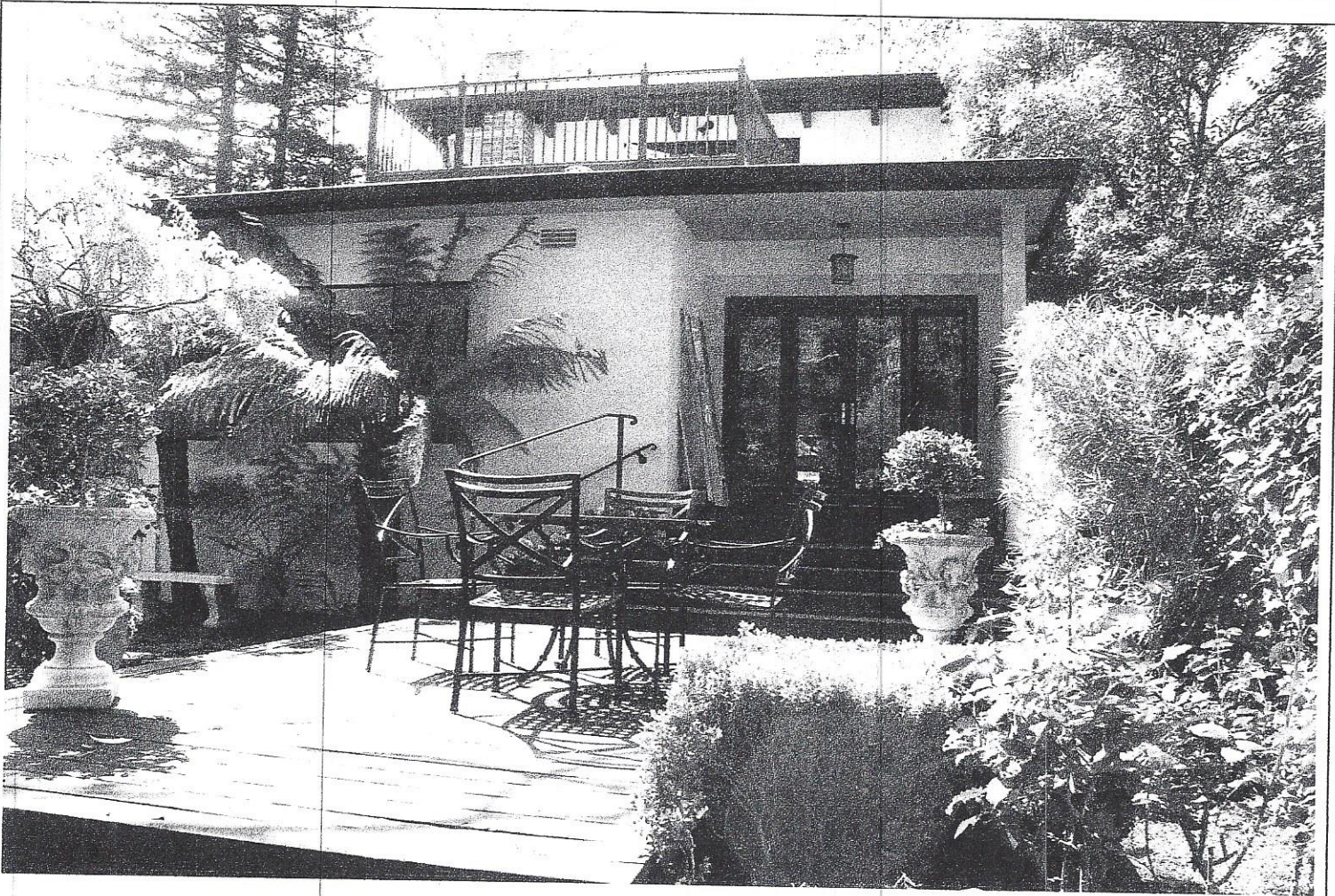
REAR VIEW - 3/22/2014

If submitting more photographs than will fit on the preceding page, affix the additional photographs below. Identify all photographs with: date taken; "Front View" and "Rear View"; and, if required, "Right Side View" and "Left Side View." When applicable, photographs must show the foundation with representative examples of the flood openings or vents, as indicated in Section A8.