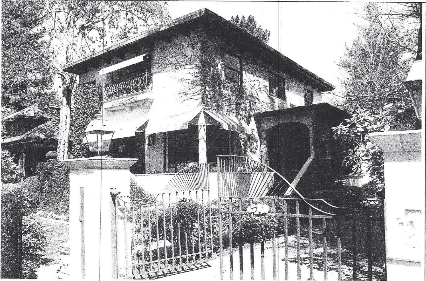
FRONT VIEW - 3/22/2014

If using the Elevation Certificate to obtain NFIP flood insurance, affix at least 2 building photographs below according to the instructions for Item A6. Identify all photographs with date taken; "Front View" and "Rear View"; and, if required, "Right Side View" and "Left Side View." When applicable, photographs must show the foundation with representative examples of the flood openings or vents, as indicated in Section A8. If submitting more photographs than will fit on this page, use the Continuation Page.