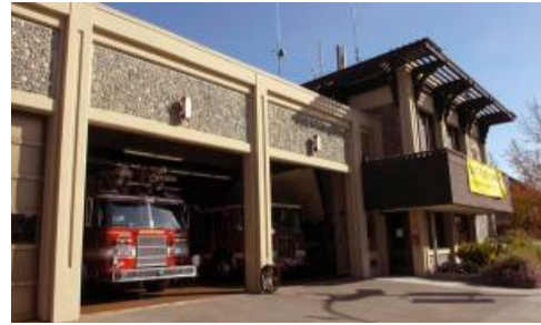
Kentfield firehouse construction will begin April 2008

The Council complimented the Ross firefighters for graciously agreeing to provide space for Kentfield, as they will bear the brunt of the inconvenience of having additional staff and equipment in tight quarters at the station.