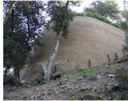
This 19-foot retaining wall at 662 Goodhill Road was built without Town approval or building permits.

The Council agreed to Don Santa’s request to continue his after-the-fact application for over 1,800 linear feet of retaining walls, up to 19+ feet tall, constructed on his Goodhill Road hillside lot since 1999 without planning department approval or building permits. The application also included after-the-fact approval of 380 yards of cut and 380 yards of fill to create terraces and paths not shown on the approved plans.