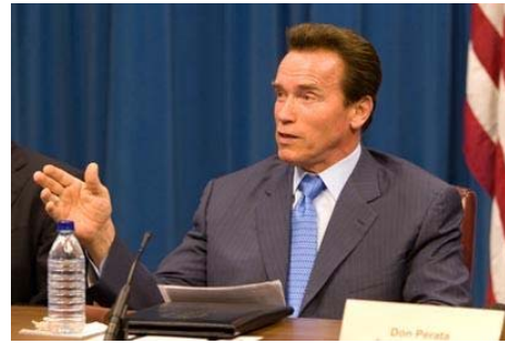
Governor Schwarzenegger opposes the state legislature's attempts to use local funds to balance the state budget deficit.

Although California voters have repeatedly approved ballot propositions protecting local government funds, the state's fiscal problems have prompted some legislators to consider seizing local government funds to finance the state budget shortfall. Governor Schwarzenegger opposes such a move, declaring it would deepen the state's structural deficit and cripple local government and transportation services.