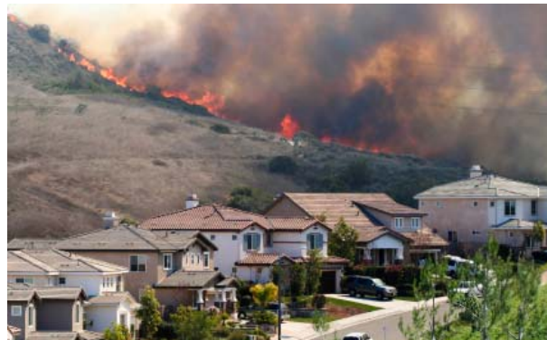
Development adjacent to open space, such as this area in Southern California, can be vulnerable to wildfires.

Local governments are required to apply these wildland-urban interface building standards to new development in very-high fire hazard areas. Although the Town has little such State-designated areas, it does have areas where it may be appropriate to apply special standards for new construction and remodel projects. Staff suggested the Council consider properties located in the R-1:B-5A and B-10A districts, which typically include larger, hillside properties, and those containing special hazard Zones 3 and 4 for ignition-resistant building regulations.