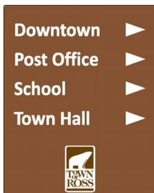
Sample Sign Design

A t the request of the downtown merchants, the Council considered directional signage to direct drivers to business in the downtown. The downtown signage issue has been discussed on and off over the years and to date, no such signage has been permitted. The Town has a tradition of keeping signage to a minimum when it comes to drawing attention to the community. Ross, while predominantly a residential community, does have a modest