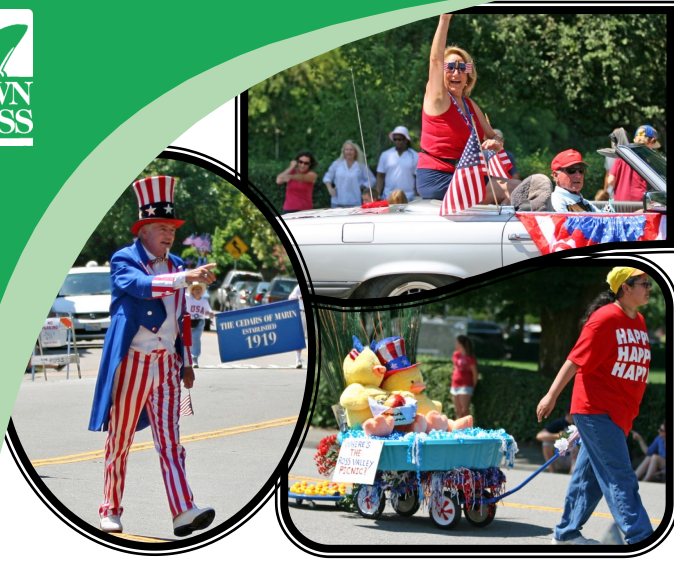
July 4th Celebration